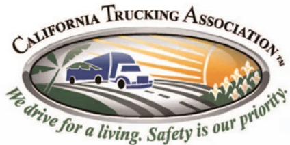
San Bernardino/Riverside Unit