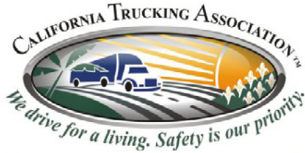
Bay Area Unit