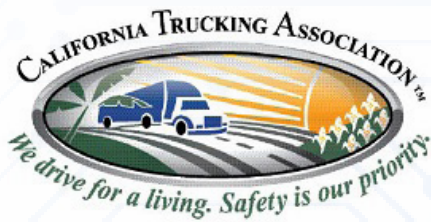
San Joaquin Unit