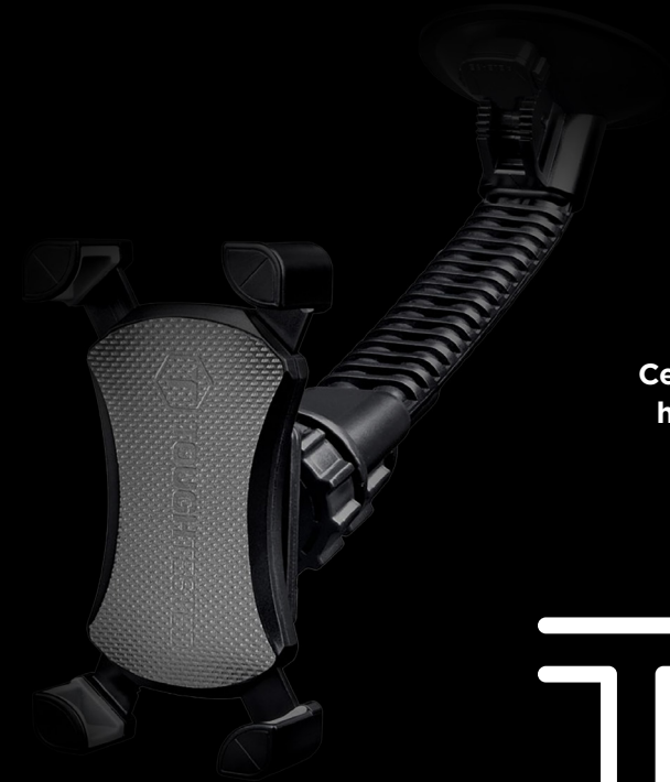
Cell phone hardware